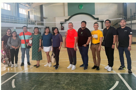
MedTech Week Quiz Show