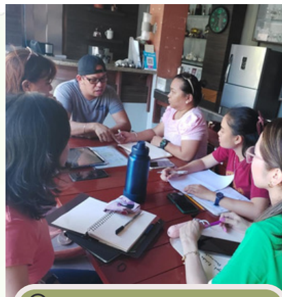
ZAMBOANGA DEL NORTE CHAPTER